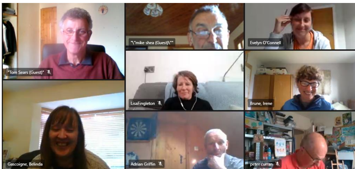
A snapshot of some of the students and their online learning experience